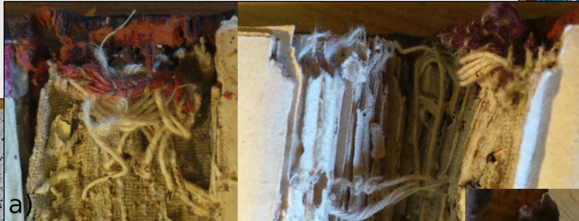
MS. Rome, BANLC, Or. 301, 1909 C.E.