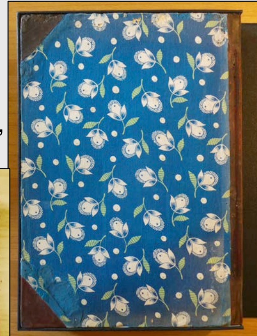
MS. Rome, BANLC, Or. 305, 1788-95 C.E. (?)