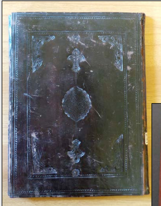
MS. Rome, BANLC, Or. 357, 1929-32 C.E.