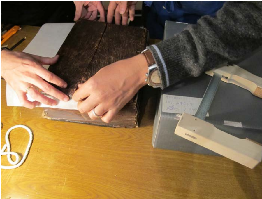
41-42: Repairing the split upper boards of MS MY-004