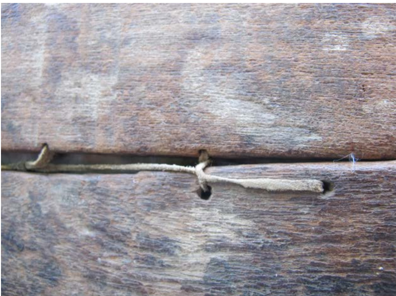
3: MS UM-39, old repair of the back board