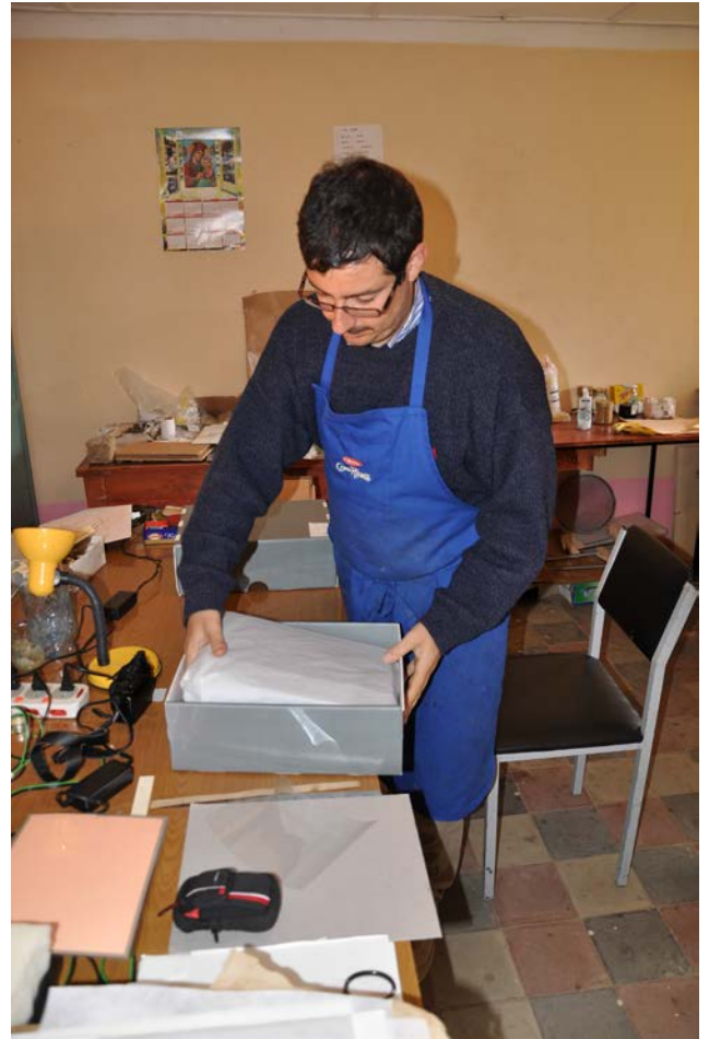
90: Stretching a leaf of MS MY-001