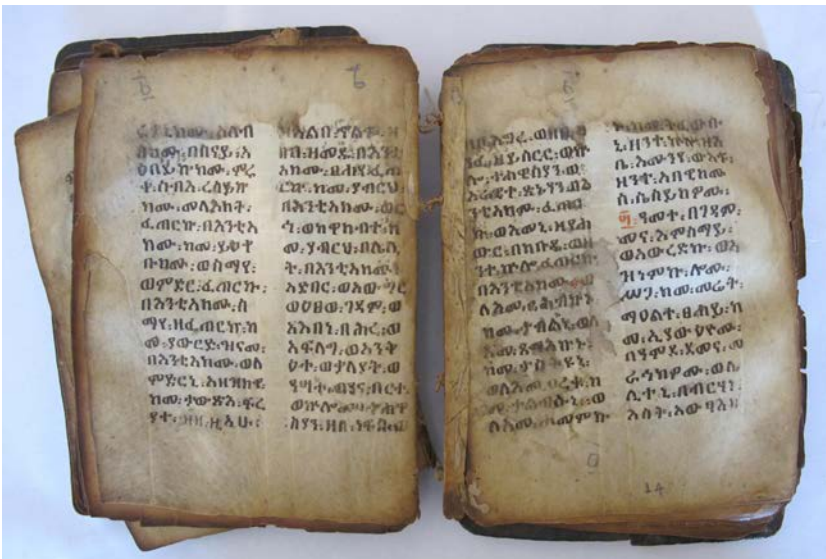
67-69: Damaged boards, loose quires of MS UM-32