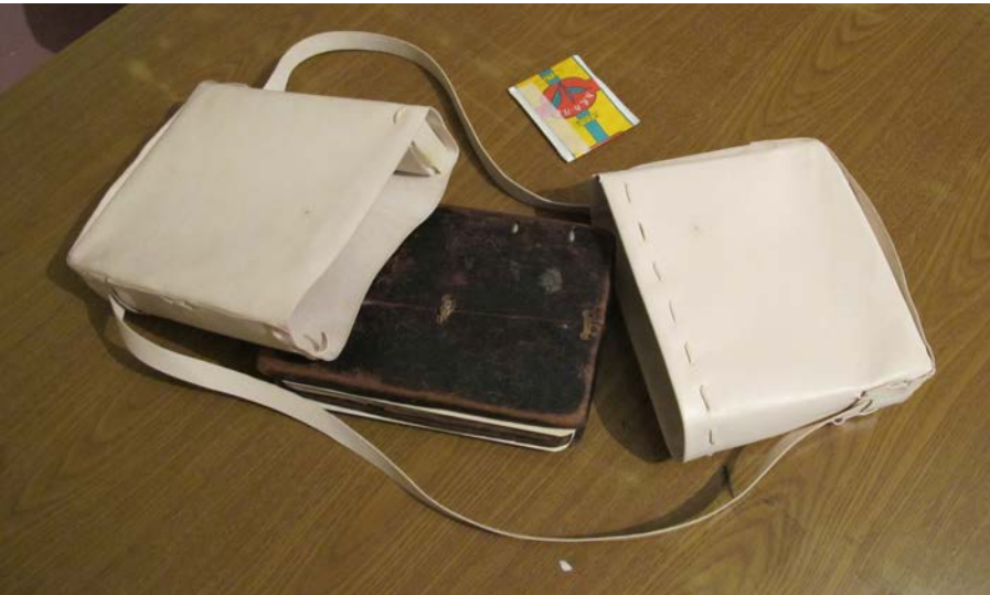
82: Representative of the community of 'Ura Qirqos with MS UM-032