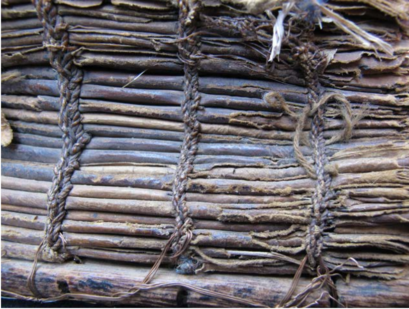
7: MS UM-52, condition of the sewing