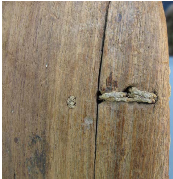
5 and 6: MS UM-27, damage and old repair on the back board