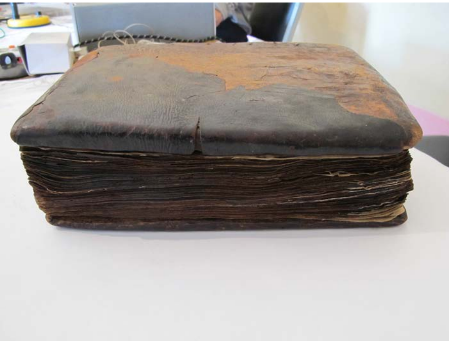
57: MS MY-004 after consolidation measures, placed in the archival box