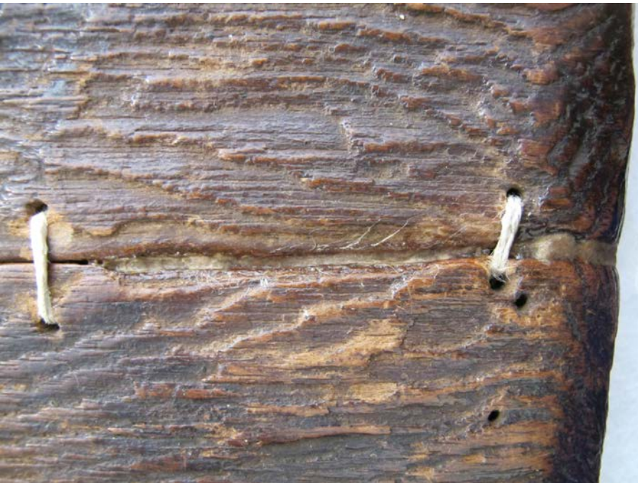
48: MS MY-004 before the repair of the sewing