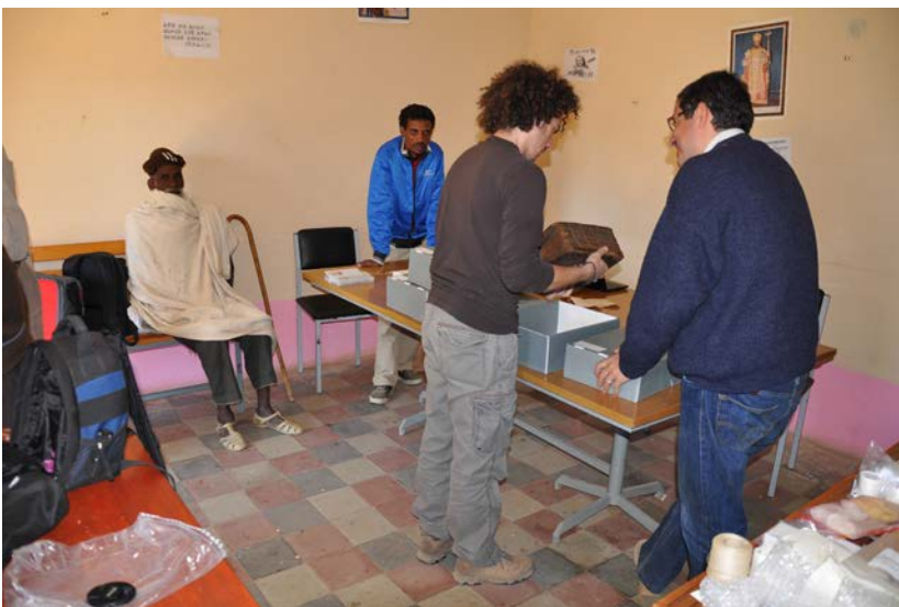
18: The first manuscript brought into the studio, ሩAddigrat