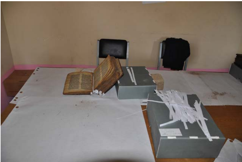
22-24: Cleaning, marking the damaged leaves