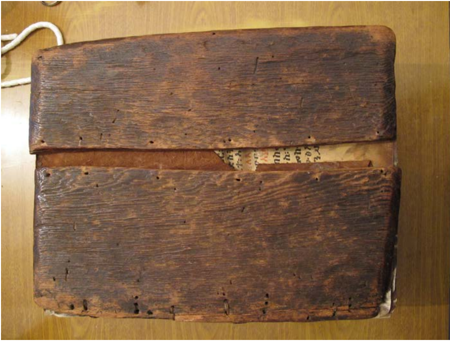
40: The split upper board of MS MY-004, remains of the leather cover visible