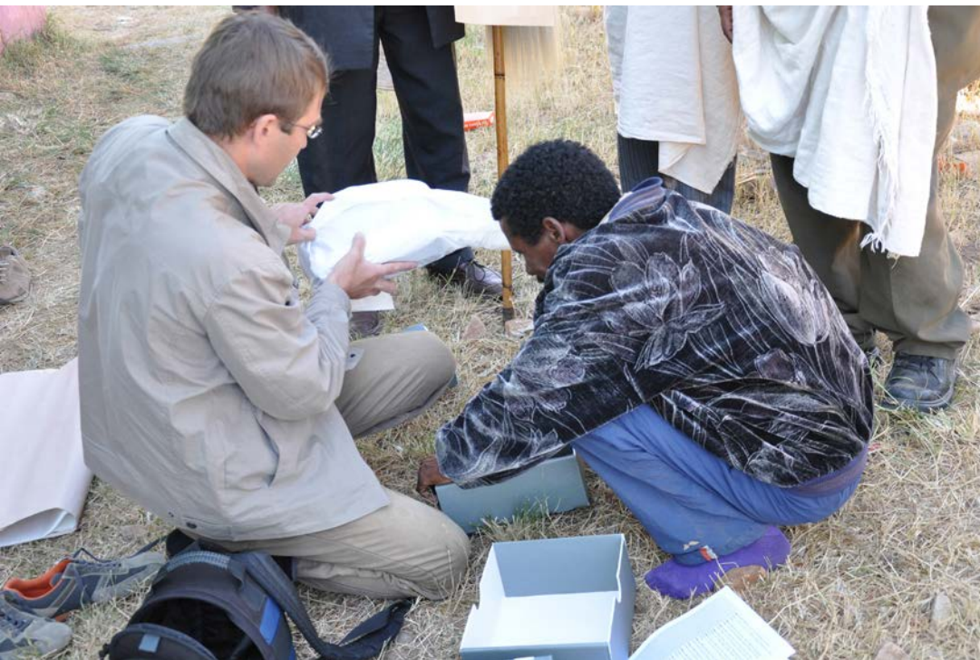
91: Preparing the manuscripts for return