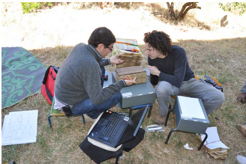
10: Conservators inspecting the condition of MS UM-27