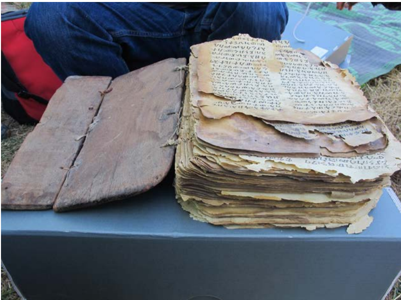
2: MS UM-39