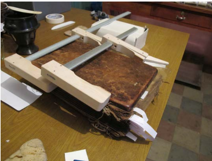
27-29: Repairing the split board, MS MY-008