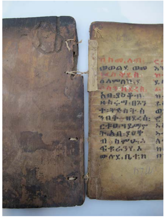
66: MS UM-32