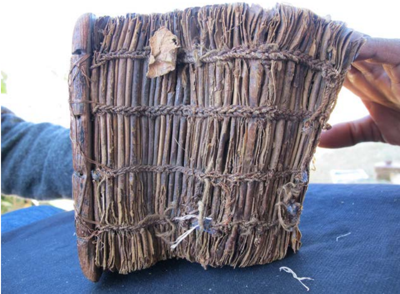
8: MS UM-52, the spine