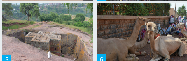
1 Script in a Gospel Book, Hangoda, Northern Ethiopia, 2 Priest holding a Gospel Book, Sebeja, Northern Ethiopia, 3 Street in Asmara, Eritrea, 4 Ethiopian scribe, Gwahterat, Northern Ethiopia, 5 Rock-hewn monolithic Church of St George, Lalibala, Ethiopia, 6 Market scene, Debarwa, Eritrea