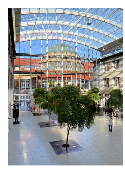
Foyer of the Asien-Afrika-Institut

Universität Hamburg Asien-Afrika-Institut Department of Languages and Cultures of Southeast Asia Edmund-Siemers-Allee 1, Ostflügel 20146 Hamburg Germany